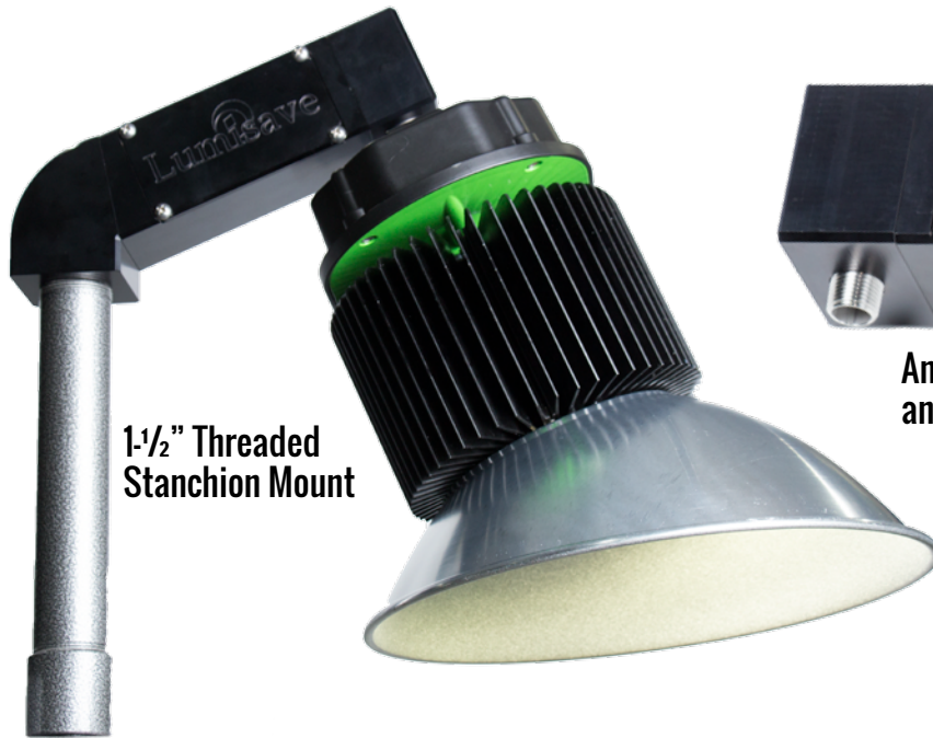
1-1/2" Threaded Stanchion Mount