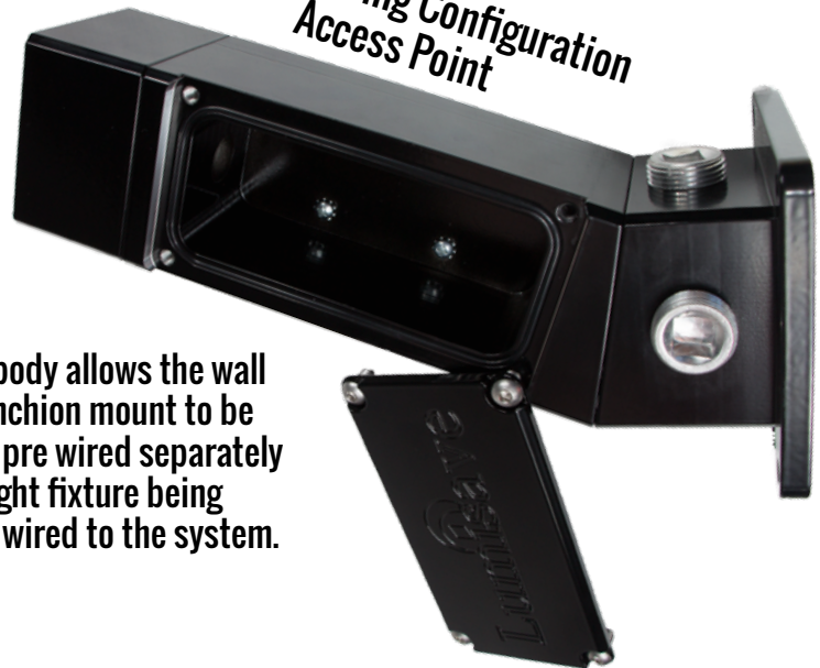
Wiring Configuration Access Point

The junction body allows the wall mount or stanchion mount to be installed and pre wired separately prior to the light fixture being installed and wired to the system.