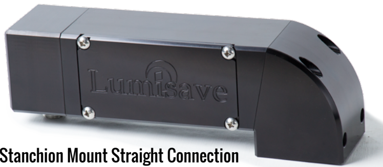
Stanchion Mount Straight Connection