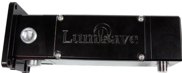
Wall Mounted Straight Connection

Lumisave has developed a unique Universal Mount suitable for any application or hazardous location. Our heavy duty mount can easily hold our heaviest Bay Light units while providing a chainable wiring connection that can have dry, wet, or hazloc connections. The UMS is intended to replace all existing Wall-Mount and Stanchion-Mount applications currently in place. The 3 section design allows for a straight (0°) or angled (22.5°) mounting by simply turning the center wiring compartment 180° at time of installation. With the addition of a wiring compartment located on the body of the mount, this allows for improved convenience of installation and maintenance. The 5 point 3/4" NPT wiring access points on the wall mount base allow for multiple Dry/Wet location wiring types and configurations including Teck Cable, BX cable, EMT and Rigid conduit.