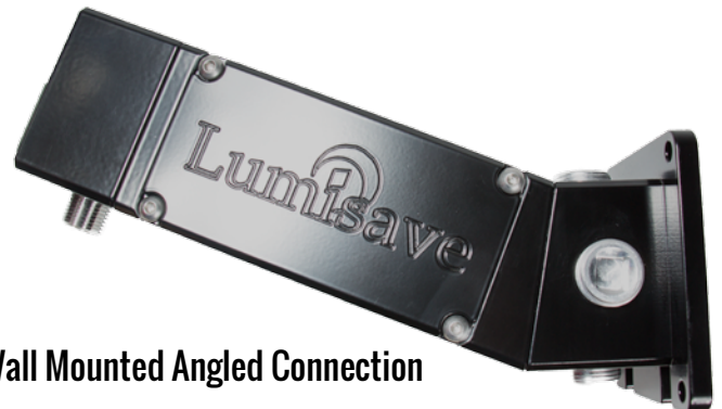
Wall Mounted Angled Connection