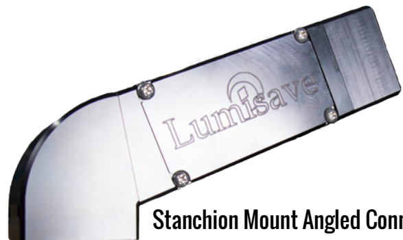
Stanchion Mount Angled Connection